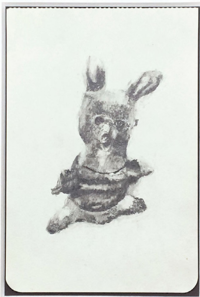
Gorbitz, 14.32 Uhr