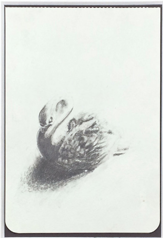
Kohlberg, 16.34 Uhr