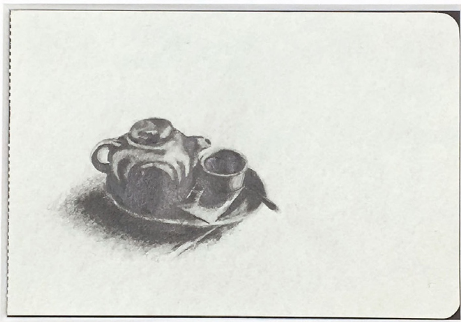
Hauptbahnhof, 08.02 Uhr