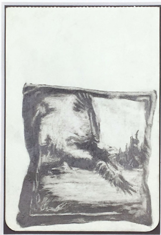
bei Omi, 12.14 Uhr