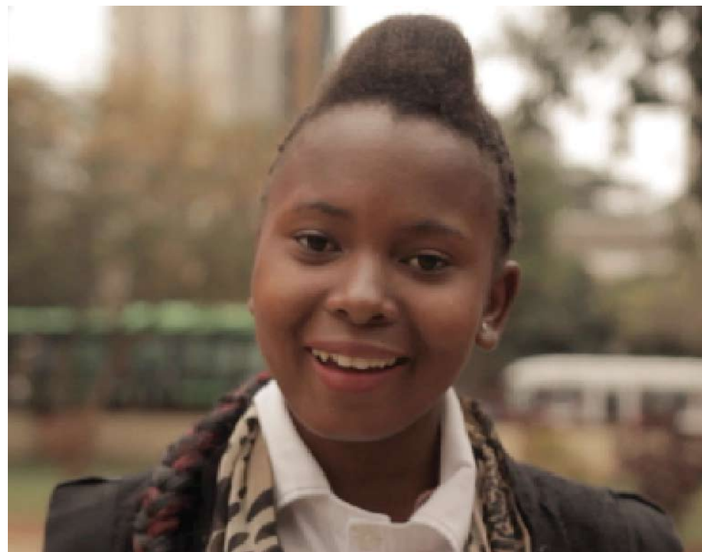
Workshop Tem esperança? , Instituto Commercial, Videostills, HDV Video, 31. 26 min, Maputo, 2016