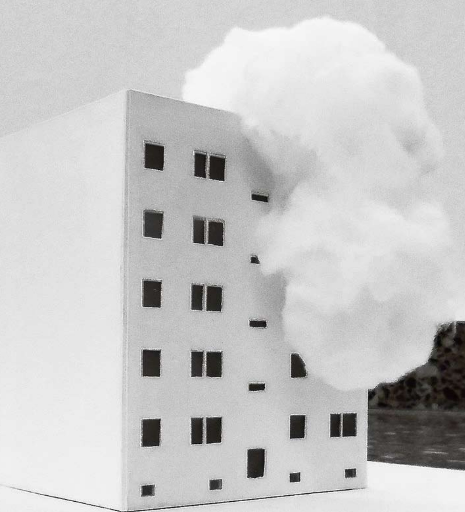
Model for clouds of sugar for WBS 70, 1:100, mixed material, Gorbitz, 2014