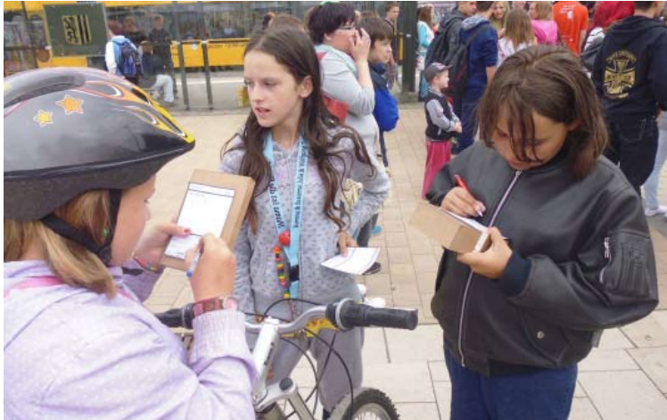
HOPEFORM Dresden Gorbitz/ Amalie Dietrich Platz, 2015 Maputo/ Instituto Commercial, 2016