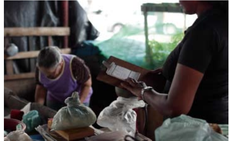
HOPEFORM Recife/ Madalena, 2014 Skopje/ Shutka secondary school, 2016